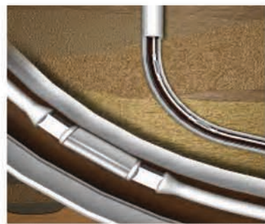
Conventional coupled rod