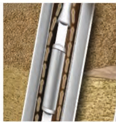
Conventional coupled rod